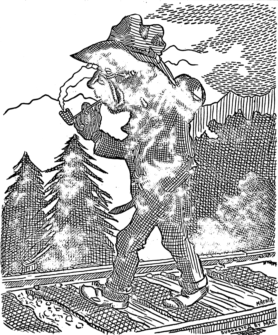
HE SAYS THE I. W. W. IS TOO D—D RADICAL

When did this question of affiliation with the A. F. of L. become an important one? What changes have been made in the program of craft unions of America that warrants this assertion? It's important to the boss and labor fakirs only. What is there in the U. M. W. A. that any body of rebels would want to affiliate with? They have the same old contracts of old, the same old labor leaders, the same old state scabbery, where one state scabs against the other in time of strikes, the same old clause in their contracts agreeing to allow the engineers and pumpmen to continue work while a strike is on among the miners, the same old blacklist system whereby miners are blacklisted from hell to Peru if they dare to violate the SACRED CONTRACT, the same old check-off system whereby the company collects the fines and dues from the members and hands it over to the officers of the union, the same old fines like were meted out to 300 coal miners in Panama recently for daring to go on strike to protect their lives. The U. M. W. A. has a set of rules and regulations called an AGREEMENT with the boss that would horrify a Fiji Islander to read. It ties the miner hand and foot and delivers him body and boots to the master class, where he cannot move while the boss is free to exploit him for all he is worth. It will be a credit to the intelligence of the W. F. of M. members to join this Civic Federationized