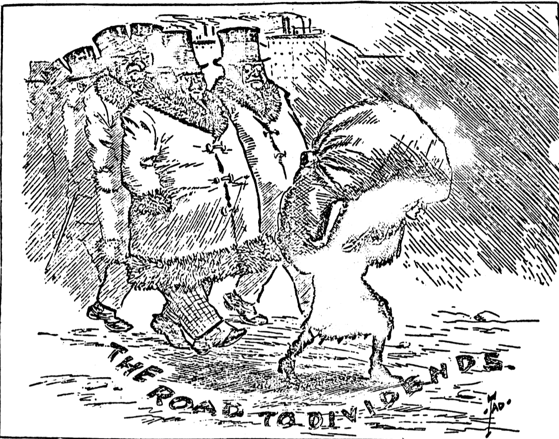
"A LITTLE CHILD SHALL LEAD THEM"—NEW VERSION

A lumberjack writes in from Haddon, Ore., to give the information that Washington and Oregon conditions in the lumber camps are not superior to those of Humboldt county, Cal. He says: "We pay 75 cents per day board here instead of 50 cents in Humboldt. We must pay straight board of $5 per week even if we lay off three days a week. We have $1 bunkhouse fee, $1 per month for hospital ticket, the same old mittens are sold as many as three dozen times in one year, and $1 is taken from our wages every time we get a job, for the same old mattress without springs. This applies to some of the biggest camps but not to all of them. In Haddon, around the mills, plenty of men are working for $1.75 per day and have to pay all the different graft fees. In the woods many men fell timber at 20¢ to 22 cents per 1000 on contract and must work like all possessed to make fair wages. Most of the log scalars or head buckers are prone to steal for the company's sake by not giving the men a fair scale. The life of a Coos Bay logger is hard." Is it any wonder that the loggers are getting ready for a big fight? They are lining up, not merely to gain better conditions but to overthrow the entire system of slavery. They know that whatever pretense other organizations may make of being industrial in form there is only one that is revolutionary. The One Big Union—the L. W. W.—is the lumber workers only hope.