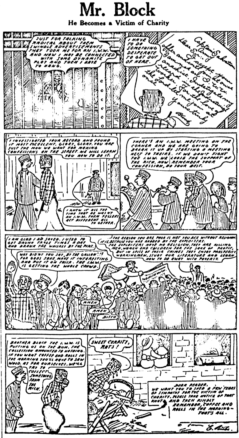
Continued Next Week

Always give old address as well as new when requesting a change. Songs to fan the flames of discontent, 10 cents. Get an I. W. W. Song Book today.