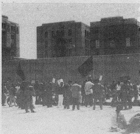
County Jail Parade