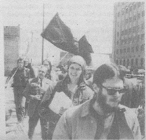
Free Everybody Rally County Jail, Mayday.

When it was all over Attorney General Mitchell asked for a law to permit him to lock dissidents up for 60 days without even letting them out on bail. We hear that Mrs. Mitchell proposed it.