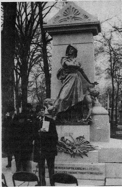
Illinois Labor History dedication at Waldheim

"Then you're picketing the wrong place. No jobs here. Go picket the Labor Temple for a four-hour day," the FW advised. "Go picket the plants on the tideflats — that's where the jobs are."