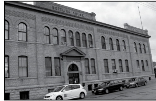
The old Bottling House.

against the system. Soon large crowds were gathering which upset businessmen and the city establishment who were often linked to the agents. The police were told to enforce an old public nuisance ordinance and one of the first to be arrested was IWW organizer Frank Little, who was murdered eight years later in Butte by capitalists. Determined to fight the ordinance by filling the jails, the call went out to “all footloose rebels and Wobblies” who soon streamed into town to take their turn on the soapbox and be arrested. After nearly two weeks, the city backed down, the prisoners were set free, and street corner organiz-