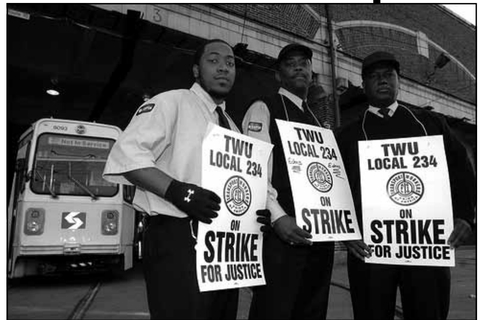
SEPTA workers picket in Philadelphia.