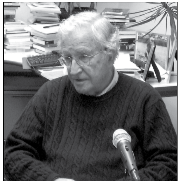
Noam Chomsky at his M.I.T. office.