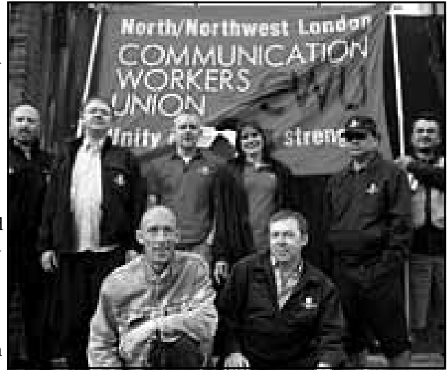
North West London CWU picket.

Finally, a postie spoke to the group on the necessity of having all unions and all unionists present a clear and consistent message to combat boss misinformation and press distortion. The message he had for the public was simple: “Postal workers live in the real world and are prepared to take action to protect jobs and public services.”