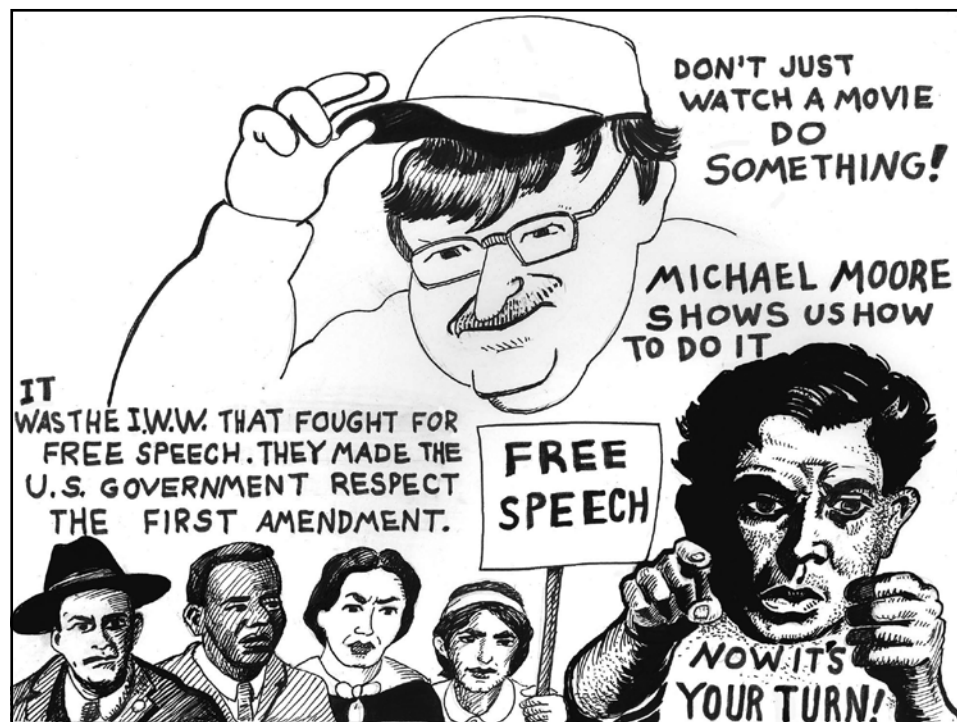
Graphic: Tom Keough

When more Wobblies get up the guts to soapbox around PNC Park in Pittsburgh, we will have built a Civil Rights Bridge to the floor of the global sweatshop. When more Wobblies soapbox outside of Starbucks, it will lead to more baristas joining the IWW.