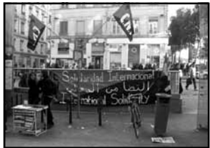
Solidarity action in Lyon.

The industrial action that the workers are taking is supported in Morocco by numerous organizations including AMDH (Association Marocaine des Droits Humains—the Moroccan Human Rights Association) and the UMT (Marocaine du Travail) trade union. However, the police forces systematically attack every support gathering. Trade union leaders from the OCP have been imprisoned and tortured, and four of them will be put on trial in November, accused of attacks on “public order.”