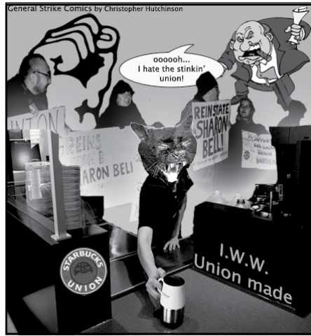
Graphic: Christopher Hutchinson

The NLRB’s decision is just the latest in a string of legal troubles for Starbucks. They have opted to settle numerous other unfair labor practice