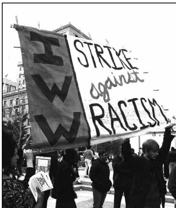
Wobblies rally in Baltimore.