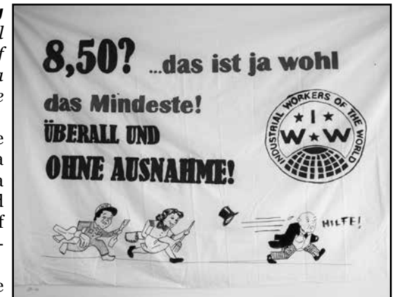
IWW Kassel banner.

On Sunday, besides the allocation of responsibilities, we discussed a currently developing labor conflict in which a comrade from Berlin is involved. Because the activists present come from different backgrounds and experiences, the advice and ideas shared during the discussion turned out to be very inspiring and helpful for everyone in attendance, especially for the FW in need.