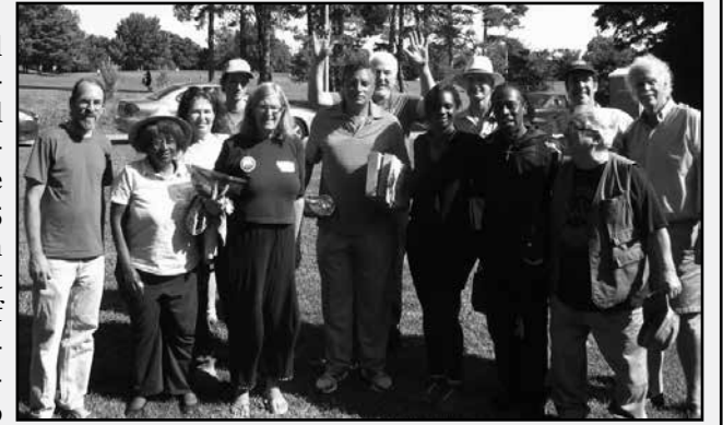
The 4th Annual BBQ To Stop Police Brutality on Aug. 24, 2014.

Wobblies from all over are invited to Pittsburgh for the Black and White Reunion’s 5th Annual BBQ to Stop Police Brutality on Aug. 1, 2015 at Overlook Shelter in Shenley Park, to protest at the Fraternal Order of Police’s National Conference in Pittsburgh starting on Aug. 9. You are also invited to the 18th Annual Summit Against Racism