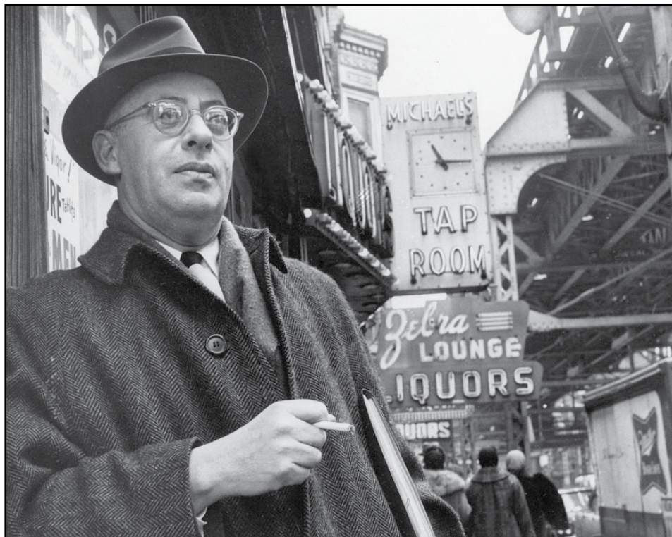
Saul Alinsky in Chicago.

And I did learn some very valuable things. The modus operandi of the New Left was that if you were incensed about an issue, you tried to do something about it. Mr. Alinsky advised newcomers to the Institute to spend some time in a target neighborhood in order to discover what issues were already “there” in the minds of residents. Also, in my experience Alinsky did not emphasize coalition-building with the principal figures in existing organizations. He challenged us to discover the informal leadership of a community: the persons to whom neighbors went for help if they had problems. The next step was to bring these informal leaders together and to stress to those gathered that all structural arrangements (who would be chairperson, for example) would be preliminary and tentative. This gave the organizer an opportunity to observe who seemed to