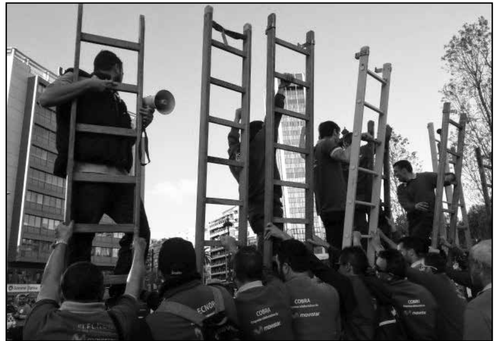
The struggle of Movistar workers is also called 'the ladders revolution.' These are workers at a recent demonstration.

The big, institutional, bureaucratic unions have had nothing to do with the real mobilization. They called for a make-believe, partial strike in order to try to interfere with the real strike. They engaged in negotiations with the company even though they didn't have the strikers' con-