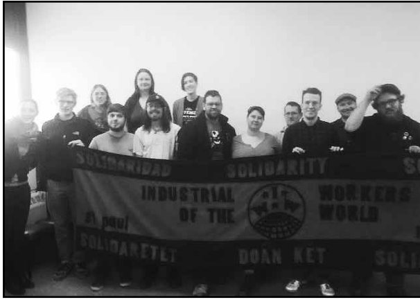
Wobs at the OT101.

In addition to the training, the Twin Ports GMB treated visiting workers to a showing of the documentary “The Wobblies” at the Jefferson People’s House,