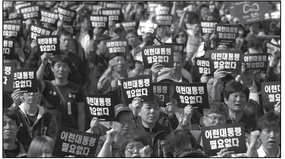
South Korean workers demonstrate on April 18.