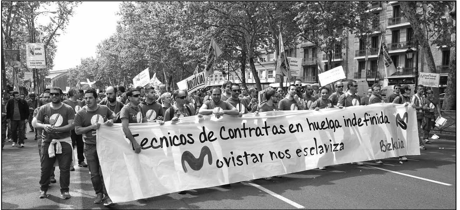
Strike of workers of Telefónica Movistar in April 2015, in Madrid, Spain.