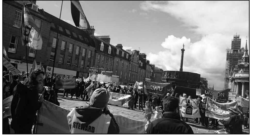
The Aberdeen IWW group participated in their first May Day, in this new incarnation, with a new flag.